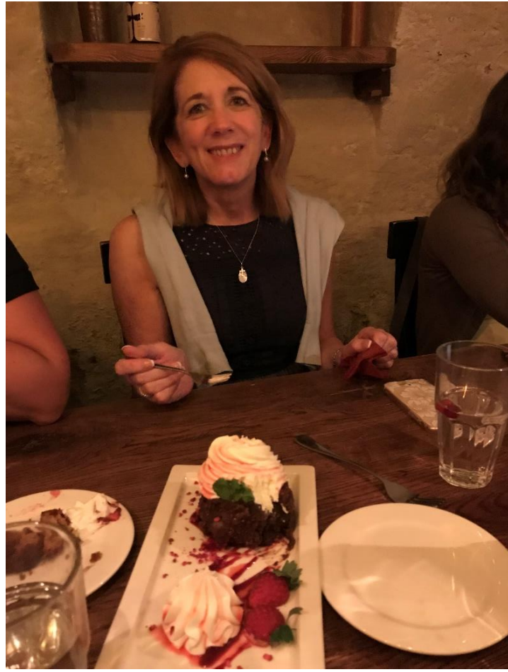
It was 10:30 in the evening when we left the restaurant and it was still light outside!

The next morning, we left our hotel on a 4.5 hour bus ride to Tallinn, Estonia.